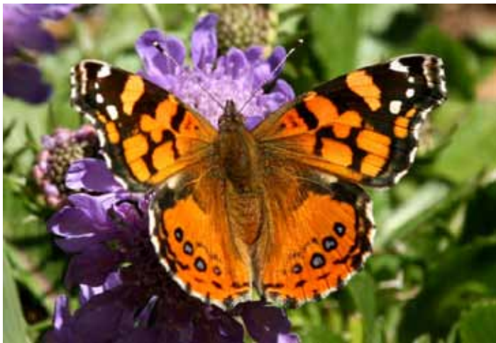
West Coast Lady Butterfly

According to Bob Langston, "aberrant forms are rare, but tend to repeat in populations throughout the years—decades, scores, centuries or longer." What is an aberration? An aberration is a differentiation in a butterfly's normal wing pattern. Butterfly aberrations can be the result of a genetic trait variation, which can be found in a