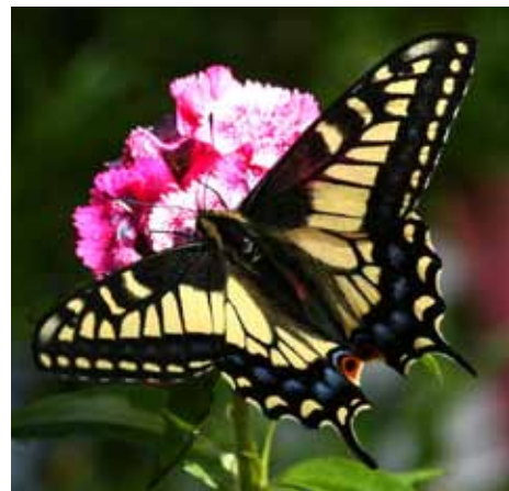
Anise Swallowtail Butterfly

Butterflies, birds, bees, flowers and trees always provide something interesting in the garden.