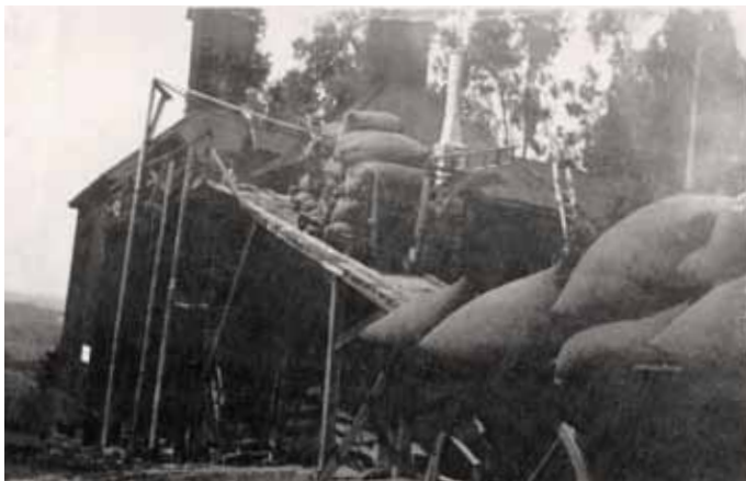
1912 Hallberg Hop Kiln

Other changes in the landscape occurred over time as well. The Black Oak tree behind the house was left to grow, even though it would have been easier to build the additions on to the back of the house without it. Now, 100 years later, this same oak tree is approximately 200 years old, and has been designated Sonoma County Heritage Tree #24. It is enormous in size.