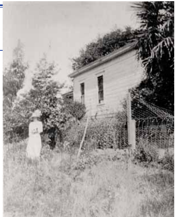
1911 South Side of House