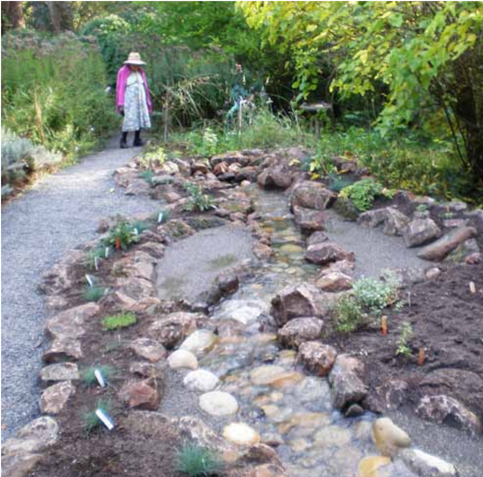
Louise at newly-completed Butterfly Creek