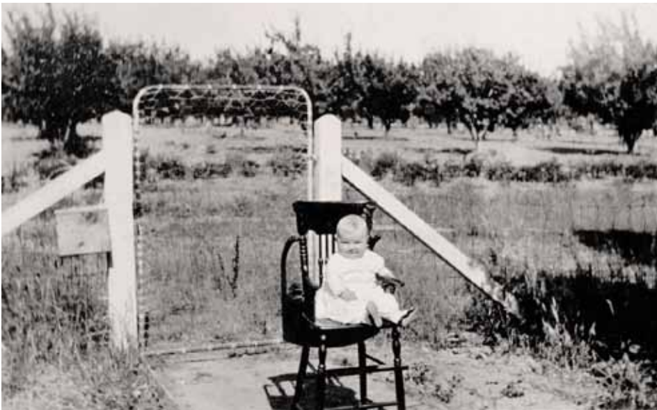
1917 Louise in Front Yard