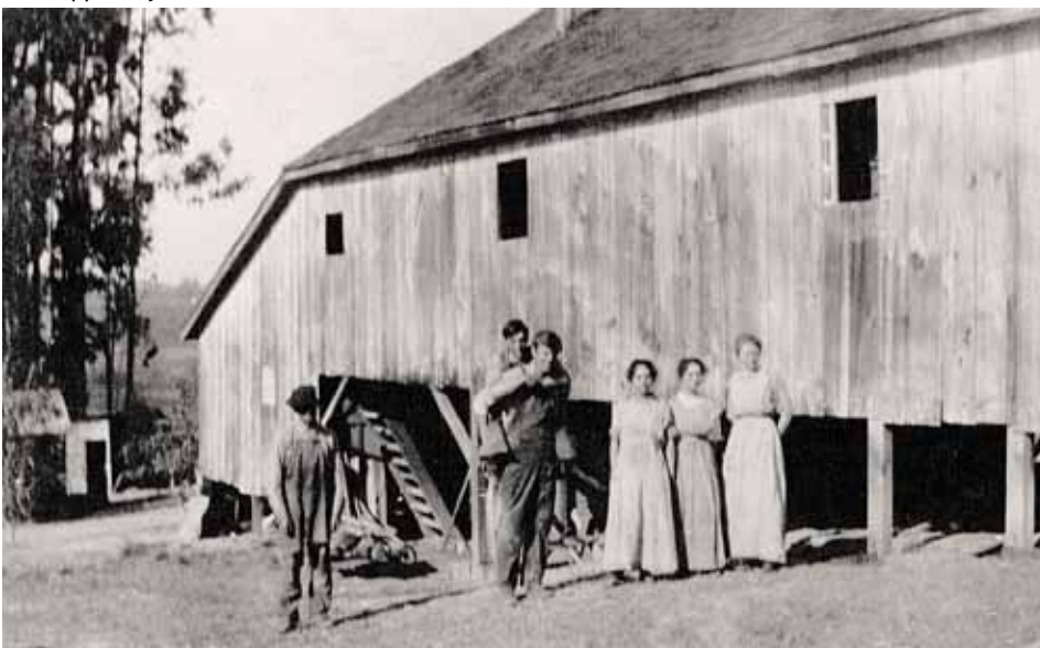
1915 Apple Dryer

The Eucalyptus trees had been planted years before for windbreaks, but as they grew tall they began shading out the apple trees, and so a number of them were cut down. Yet many still remain, and they have served as nesting habitat for the Great Horned Owls.