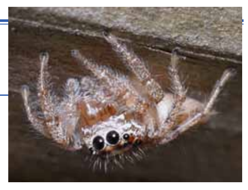
A jumping spider (Colonus hesperus) awaits a meal on the information kiosk at Hallberg Butterfly Gardens