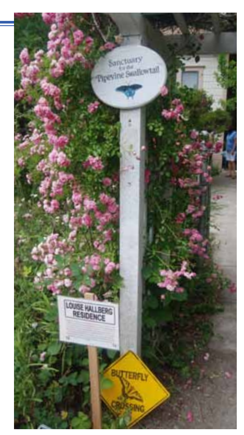
Climbing rose framing the entrance to the Hallberg house